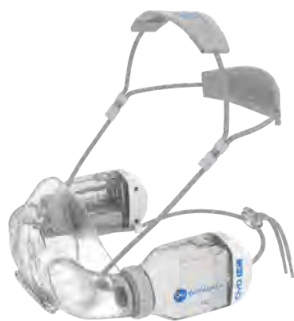
Healthcare Reusable Respirator