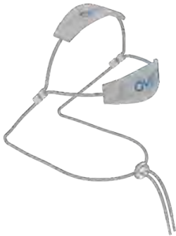
AYO Head Strap Assembly