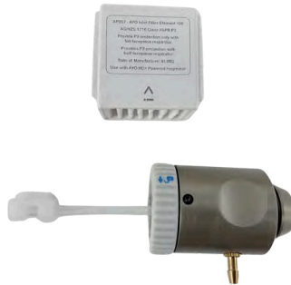
Fit Testing Kit