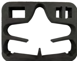
AYO HC EVA case foam insert