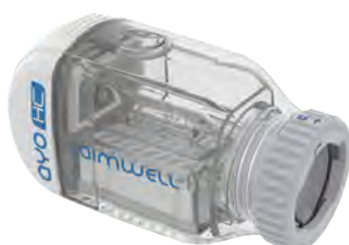
HCo Module - excluding filter