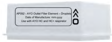
Exhalation Filter - Droplets Pack of 3