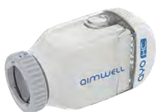
HCi Module - excluding filter