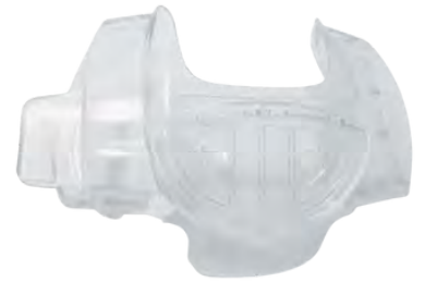
AYO Mask Bridge Assembly