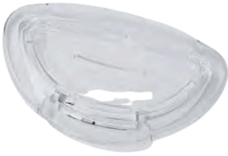
AYO Mask Speech Diaphragm Cover