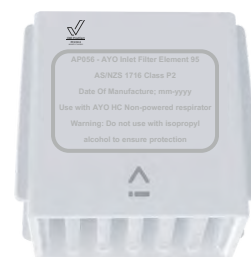
Inlet Filter Element 95 - Pack of 3