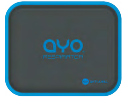
AYO EVA Case